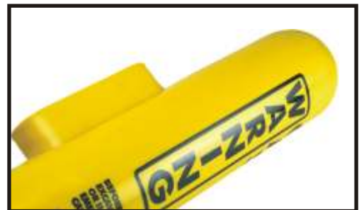
Line Marker / Test Station Combos available