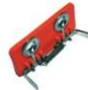
Shunts - 0.001Ω, 0.01Ω, 0.1Ω